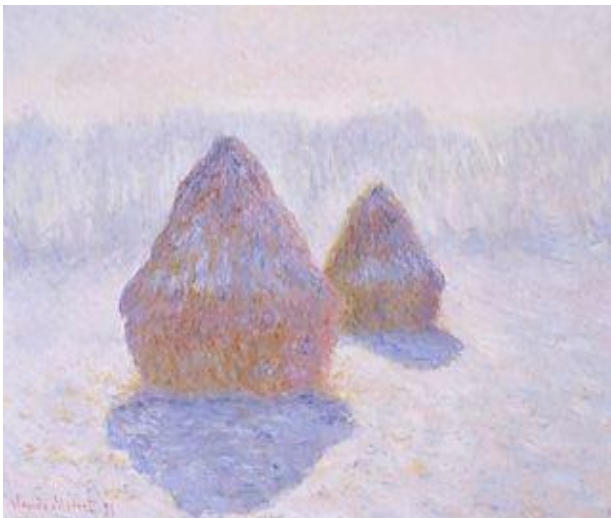
Haystacks (Effect of Snow and Sun), 1891, by Claude Monet.

The greater, or higher, the contrast of tones, the more dramatic the atmosphere.