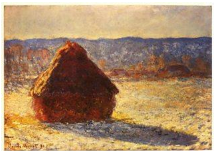
Haystack (Morning Snow Effect). (Meule, Effet de Neige, le Matin), 1891, by Claude Monet.