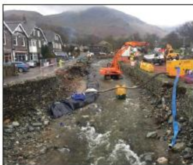
Glenridding village river channel blocked by boulders

CAUSES: A tropical maritime air mass, driven by the jet stream, carried a lot of moisture across the Atlantic to the UK. As these warm, wet winds (atmospheric river) hit the Cumbrian Highlands, air was forced to rise. Air cooled and condensed to form clouds, releasing huge amounts of rain in one 24 hour period- 341.4mm – a new record for the UK. This rain fell on already saturated soils and so water ran quickly into the river through surface runoff. Carlisle is at the confluence of the Rivers Caldew and Eden and the city is built on a floodplain, increasing the likelihood of homes and businesses being flooded. The intense low pressure also caused winds of over 100mph