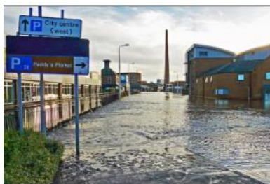
Streets of Carlisle flooded