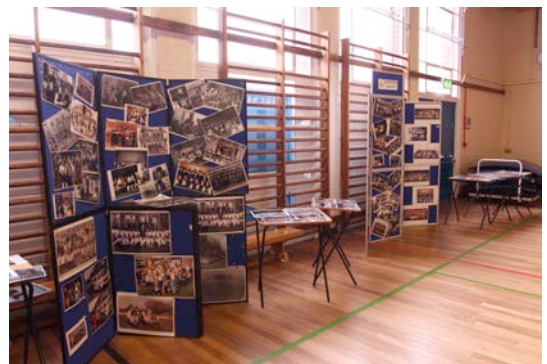
Our display of old photos was pored over as people tried to identify themselves and their friends.