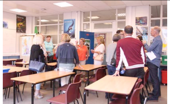
Tours of old form rooms proved very popular.

We hope to hold more reunions in the future so watch this space.