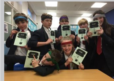
Pictured above are current students showcasing their Ninja level.