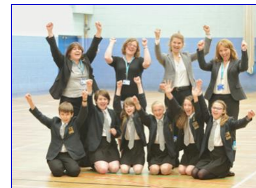
Ofsted picture

strengths and developments made since the last inspection. If you haven't already, you can access the report from our website.