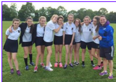
Year 9 Bolton Champions