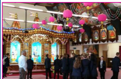
The Swaminarayan Mandir

On the 2 nd and the 4 th of June 140 of us from Year 7 had the opportunity to